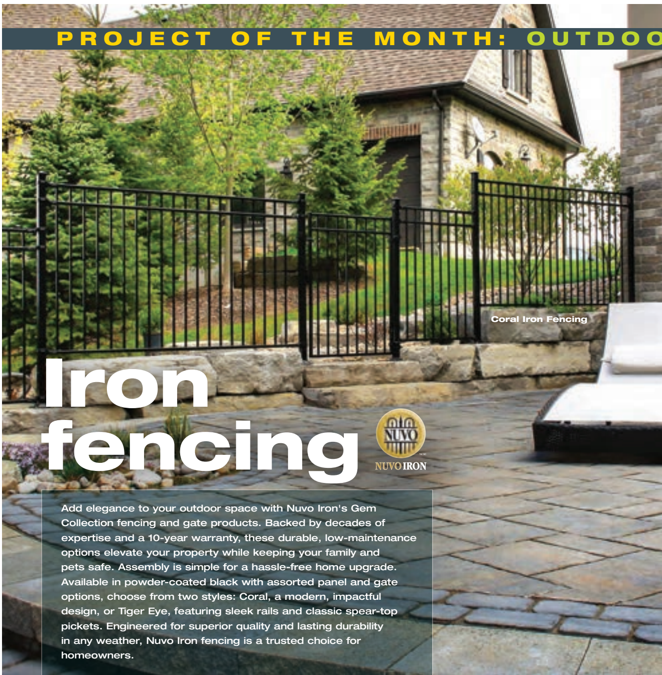
Coral Iron Fencing