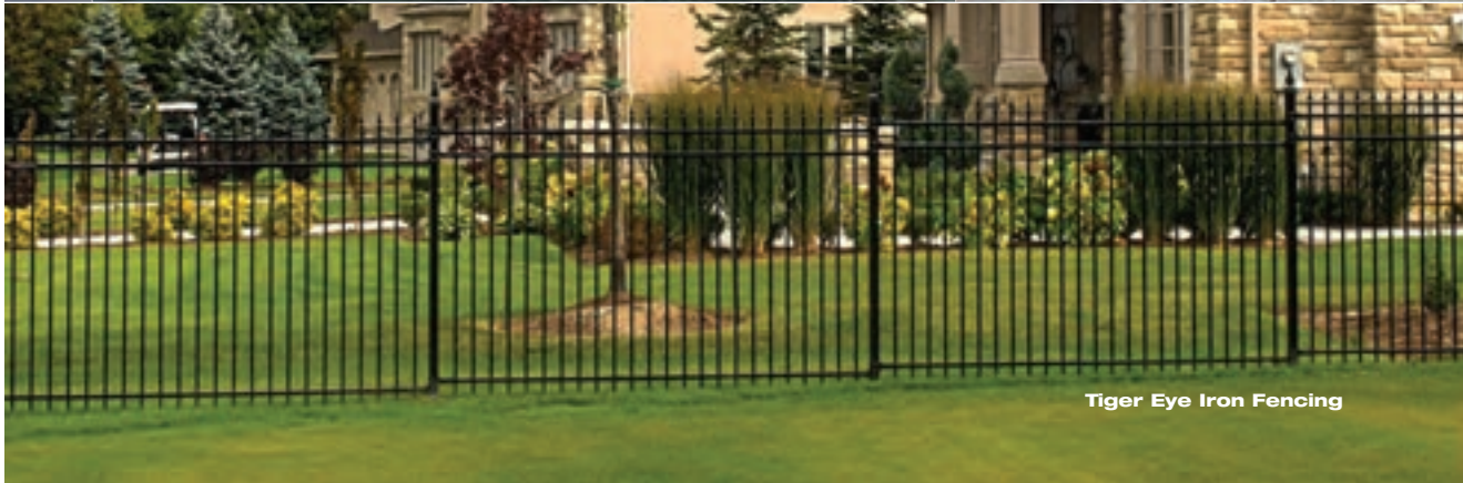
Tiger Eye Iron Fencing

Add elegance to your outdoor space with Nuvo Iron's Gem Collection fencing and gate products. Backed by decades of expertise and a 10-year warranty, these durable, low-maintenance options elevate your property while keeping your family and pets safe. Assembly is simple for a hassle-free home upgrade. Available in powder-coated black with assorted panel and gate options, choose from two styles: Coral, a modern, impactful design, or Tiger Eye, featuring sleek rails and classic spear-top pickets. Engineered for superior quality and lasting durability in any weather, Nuvo Iron fencing is a trusted choice for homeowners.